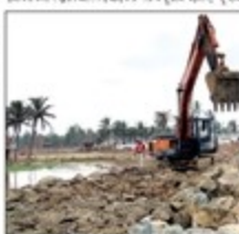
ਸਰਕਾਰੀ ਸਿਖਲਾਈ ਵਿਭਾਗ-ਸਾਹਿਬਜ਼ਾਦਾ ਲਾਲਾ ਲਾਜਪਤ